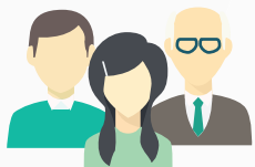
Citizens, Residents, Businesses, Foreigners