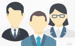
Agency admin, Back-officers, Front-officers, Government representatives